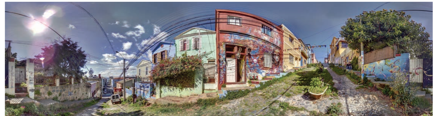
Z+F HDR point cloud of the streets of Valparaíso, Chile