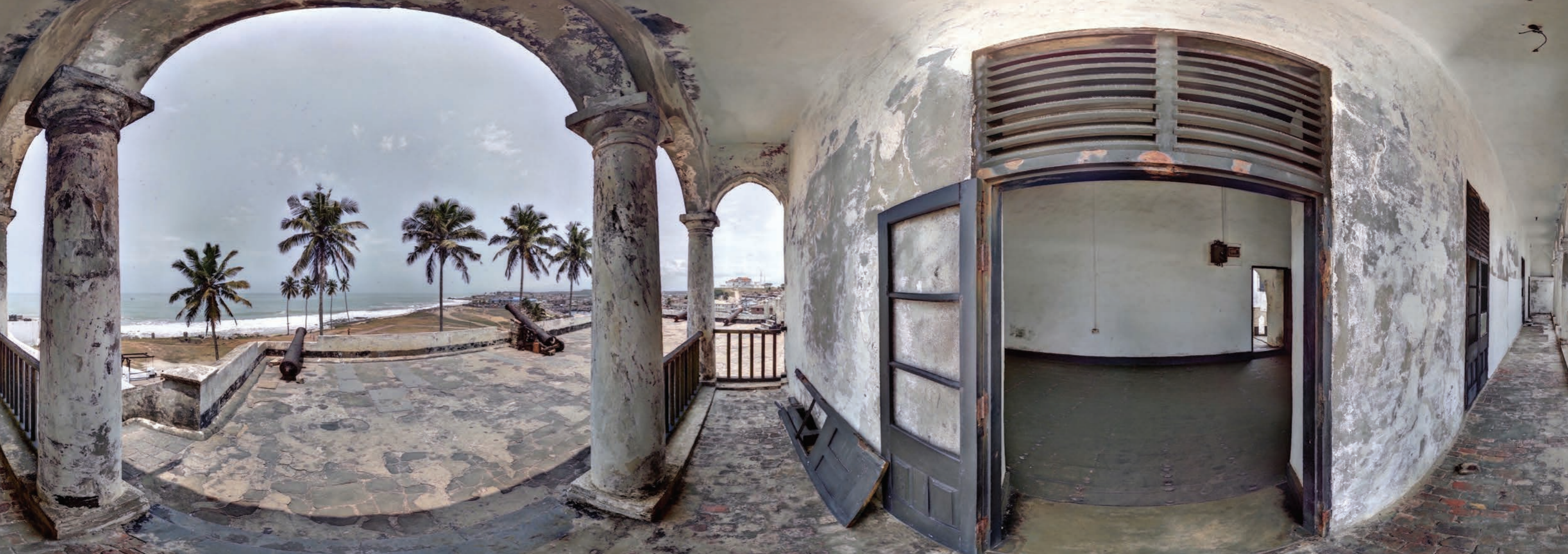
Z+F HDR point cloud of the Z+F IMAGER® 5010C, Ghana, by the Zamani Project, South Africa