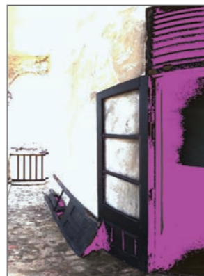
1b) underexposed areas in pink