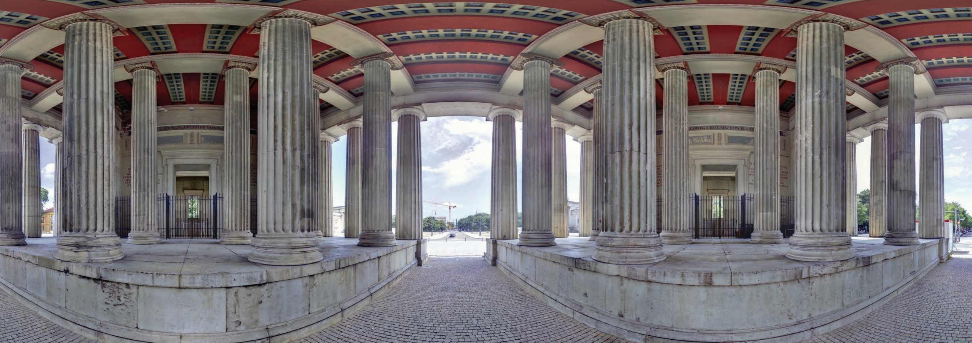
Z+F HDR point cloud of the Z+F IMAGER® 5010C