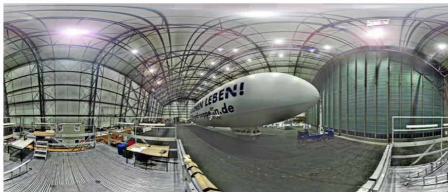
Scan of the Zeppelin NT-Hangar