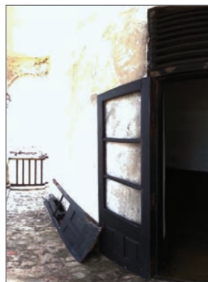
1a) standard picture in a high-contrast scene

Everybody knows the problem: When taking a picture of a scene with a high contrast, (e.g. picture 1a) the photo usually contains some overexposed and underexposed areas and one has to decide which part to expose correctly. Standard cameras aren't equipped with sufficient dynamic range to feature all intermediate stages between the lightest and darkest pixel. If one brightens up or darkens the area later with the help of image processing, one will not be able to restore the details.