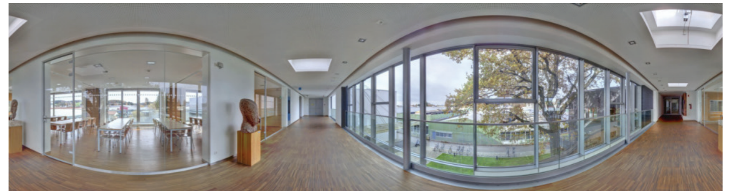
The Z+F HDR technology is simple to use even in scenes with high contrasts.