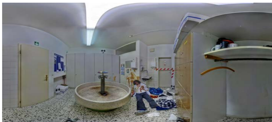
HDR point cloud with a Z-F IMAGER® 5010C of a simulated crime scene

Z+F HDR and the integrated automated white-balance process allows the simple, reliable, objective and fail-safe acquisition of colour information, even in direct sunlight.