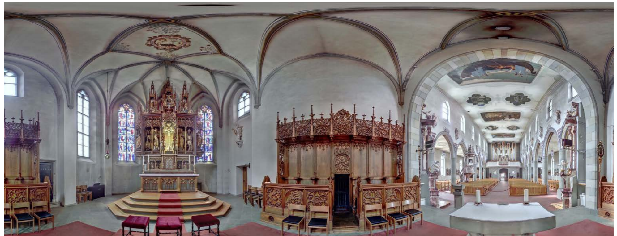
HDR point cloud of "St. Martins Church", Wangen im Allgäu, Germany

By using the HDR technique, objects are being displayed perfectly exposed irrespective of the strong contrasts. This makes it easier to distinguish between different material and creates a more realistic impression.