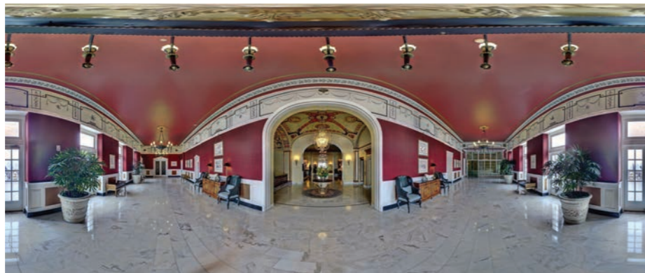
HDR Point Cloud, Hotel "The Broadmoor", Colorado Springs, USA

Even colour scans in high contrast scenes inside of buildings with big glass fronts can be captured with HDR.