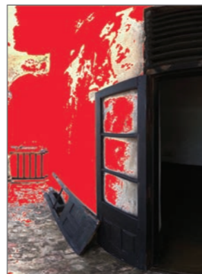
1c) overexposed areas in red