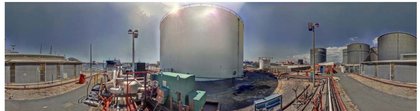
Point cloud of a site with strong backlight.