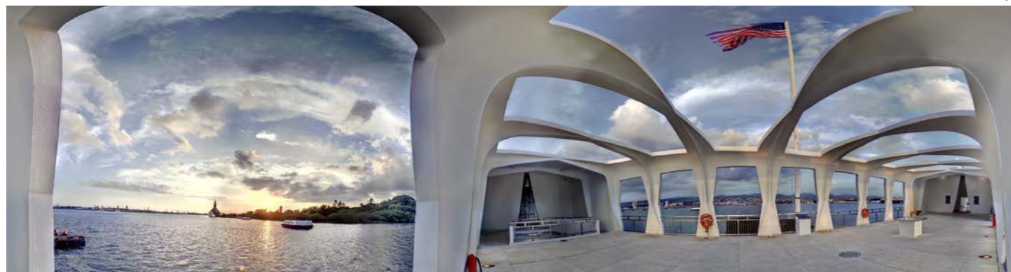
Sam O. Hirota, Inc, Hawaii