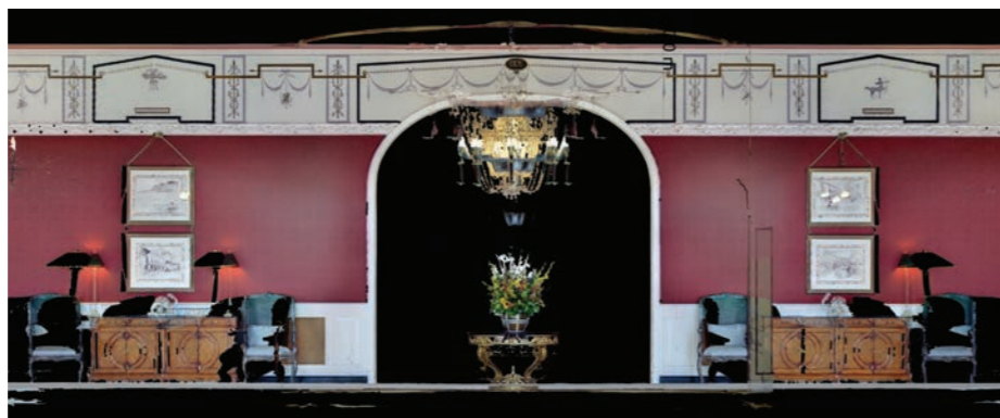
HDR orthophoto of a wall, derived of the above scan