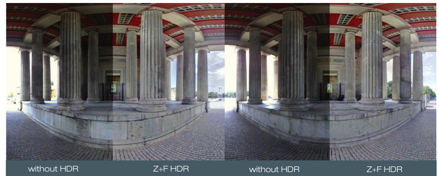
Comparison between a Z+F HDR result and a standard picture

The HDR picture is being generated in the Z+F LaserControl® software and combined with the point cloud automatically. Compared to the manual method, Z+F's HDR procedure does not require any previous knowledge in the field of photography, e.g. about aperture and exposure time, and allows a simple and quick 3D documentation of the surrounding area.