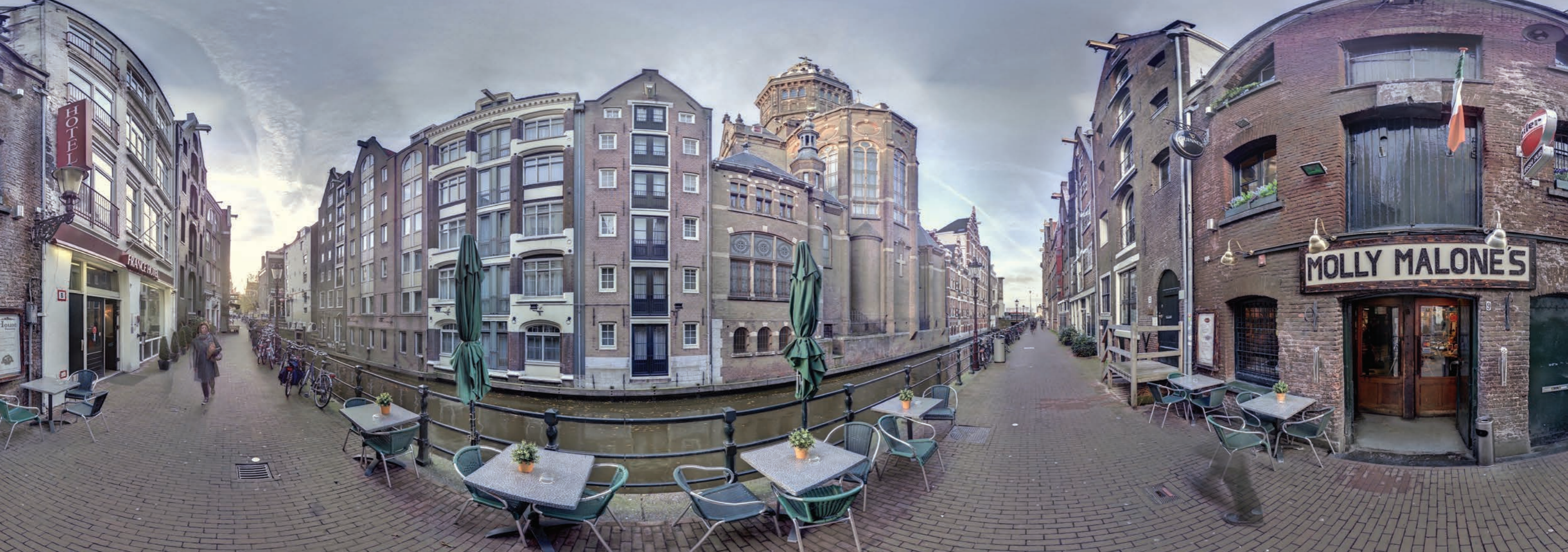
Z+F HDR point cloud of the streets of Amsterdam, Netherland