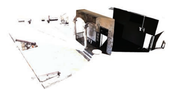
3D scan without HDR colour