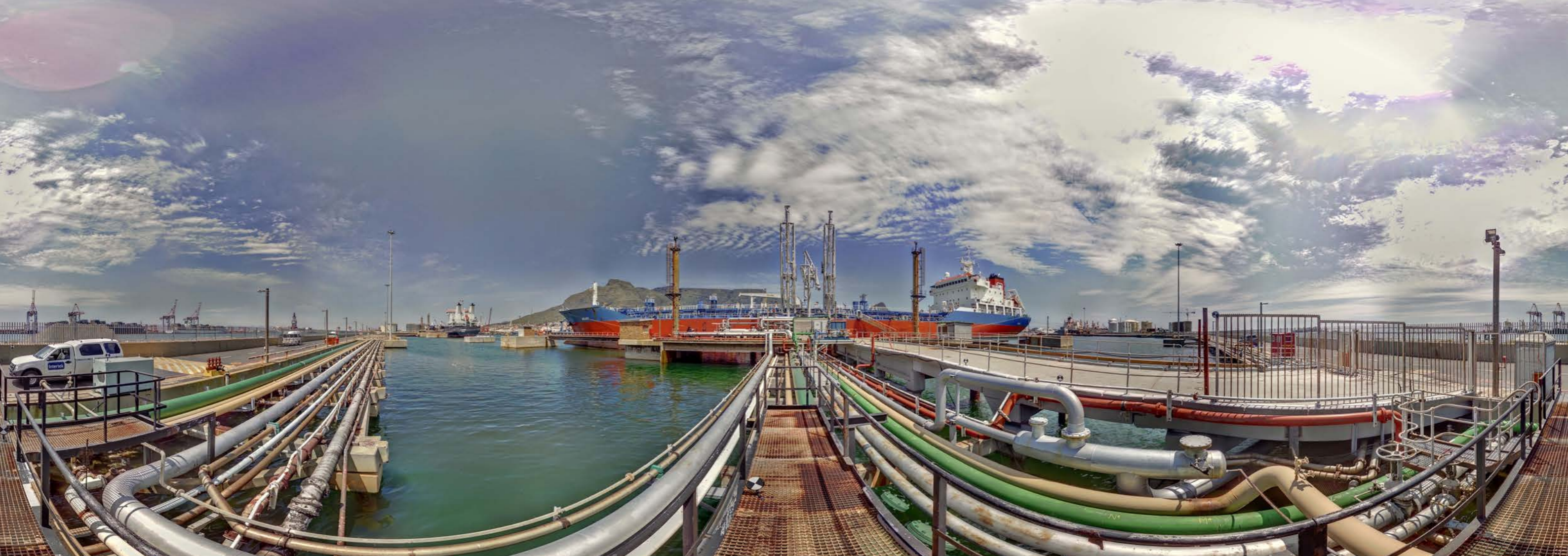
HDR point cloud of the Z+F IMAGER® 5010C in the harbour of Cape Town, South Africa. The colour of the pipes indicate their content and condition.