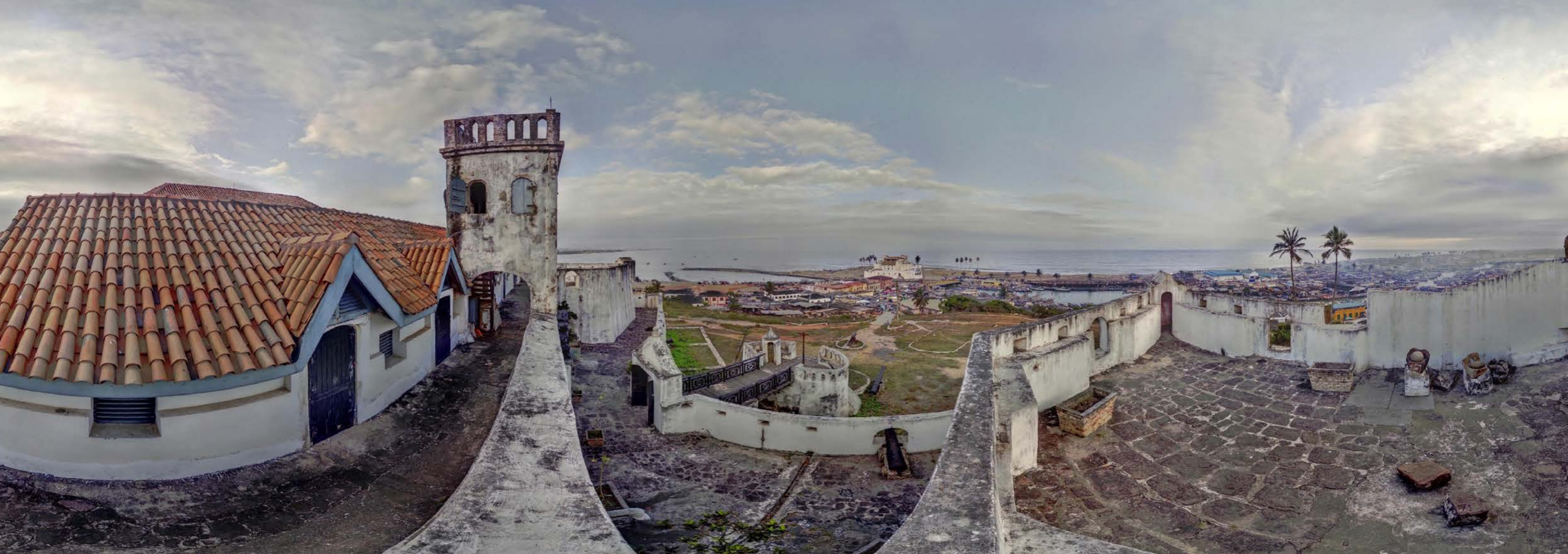
Z+F HDR point cloud of "Fort St. Jago", Ghana taken by the Zamani Project, South Africa