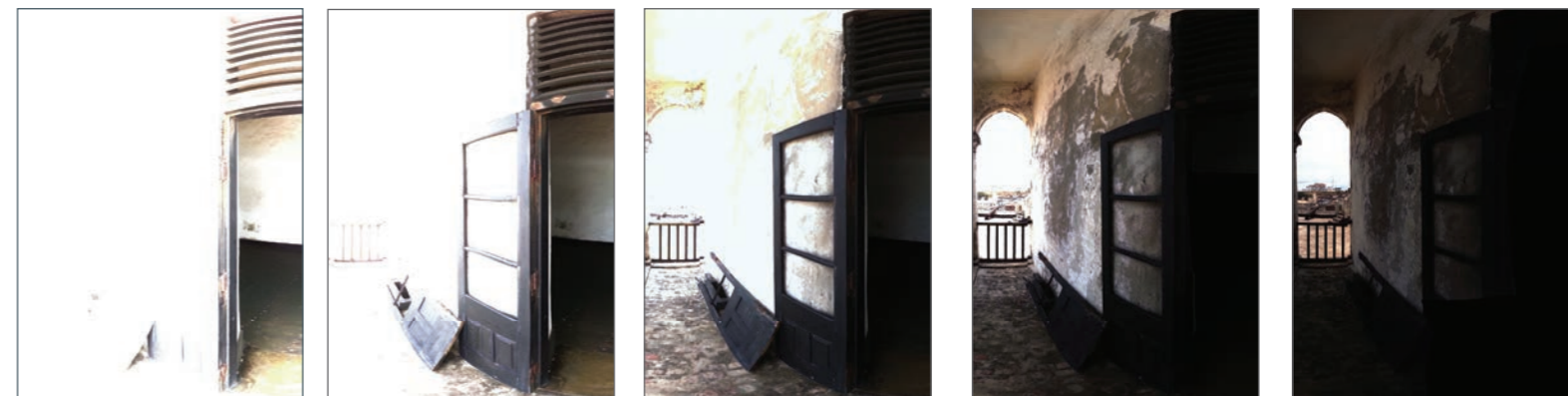
For a HDR picture, several images with different exposures are made and combined (see above).