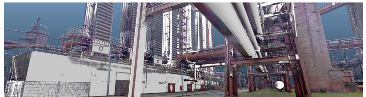
Point cloud with an overlaid CAD model, Zeche-Zollverein, Essen, Germany