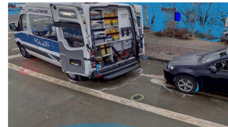
3D modell of an accident scene