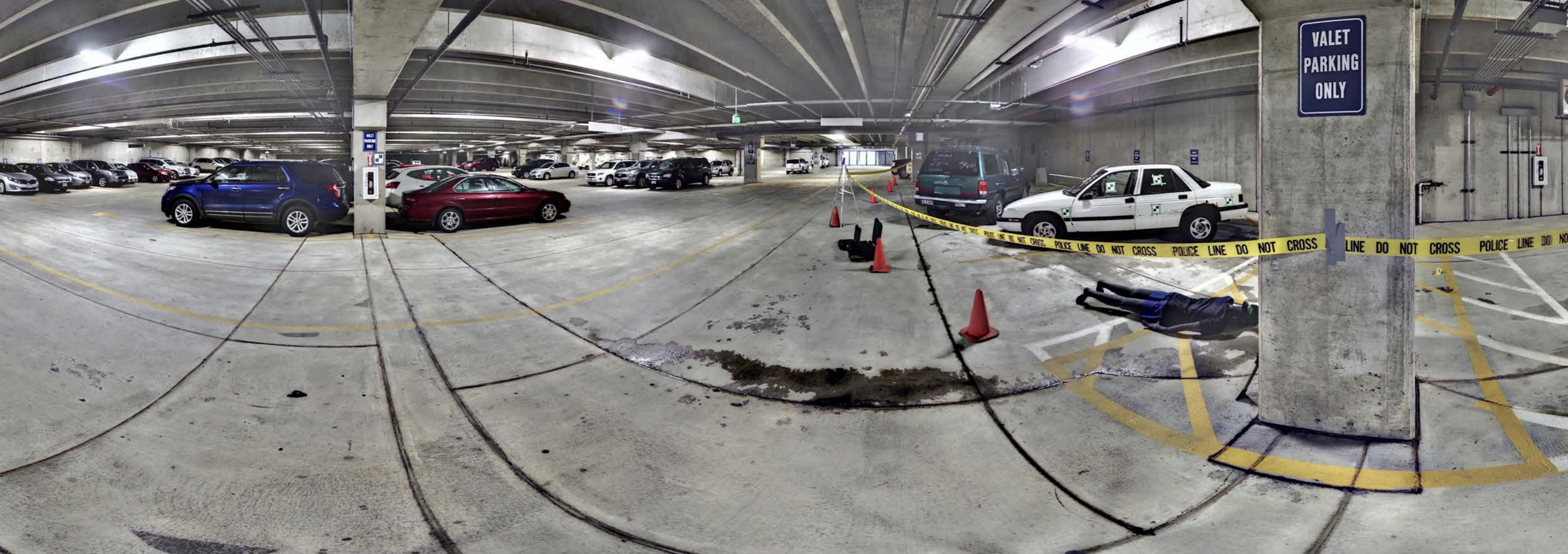
HDR point cloud allows the objective documentation of crime scenes. Even black objects on dark background can be identified.