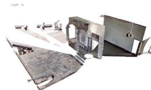
3D scan with HDR colour